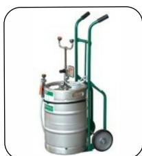
Hand cart with strap